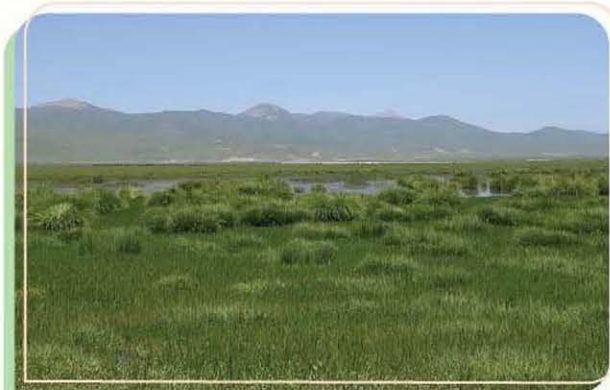
沼澤化草甸 Meadow marsh