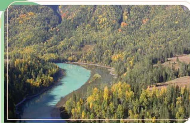
高山的河流 River in high mountain

We benefit from wetlands in many different ways. Wetlands store water, filter water, protect shorelines, store flood waters, provide resources for natural products, provide food and habitats for wildlife, and provide opportunities for recreation.