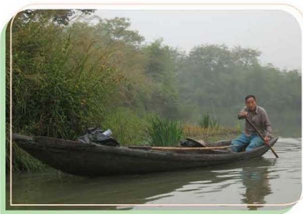
河道是運輸的主要渠道 Rivers are important means for transportation

Rivers are channels for transporting goods and passengers. Cities at estuaries serve as relay hubs for passengers and goods from sea-faring journeys to inland cities via rivers and channels. Various world trade centres are developed from these stopovers. Nowadays, inland shipping is widely adopted because of its high carrying capacity and relatively low operation cost.