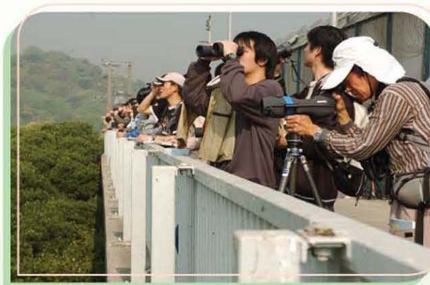
濕地亦是觀鳥愛好者的地方 Wetlands are good spots for watching birds

濕地的功能與我們的生活息息相關。為確保我們有優質的水源，並保障我們及野生生物的健康，我們必須採取行動，保護我們的濕地。