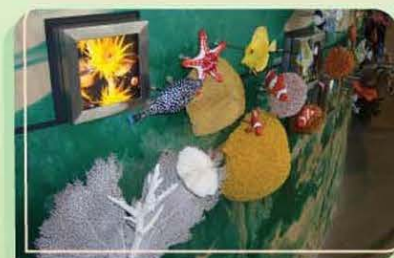
濕地是眾多生物的棲息地，而「濕地知多少？」展覽廊內亦展示了各種不同濕地生境的動植物 Wetlands provide essential habitats for wildlife. The life wall in "What are Wetlands?" Gallery demonstrates wetlands are homes to diverse animals and plants