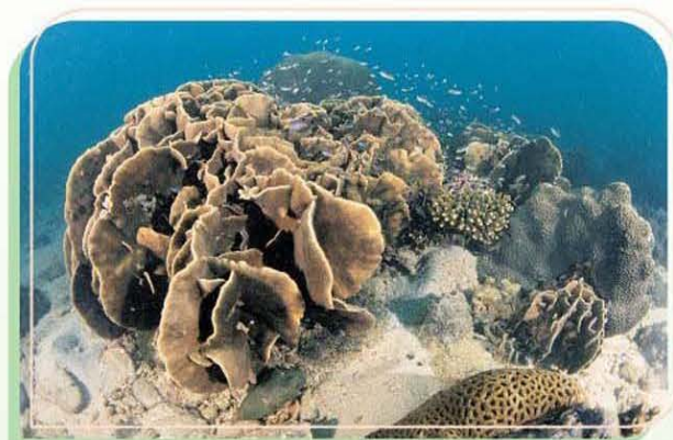
珊瑚礁是浮潛的理想地點 Coral reefs are ideal places for snorkeling

Wetlands provide us with venues for recreational and educational purposes, like bird watching, wildlife photography, fishing as well as swimming.