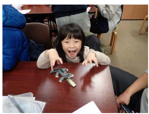
Badge and Origami Workshops