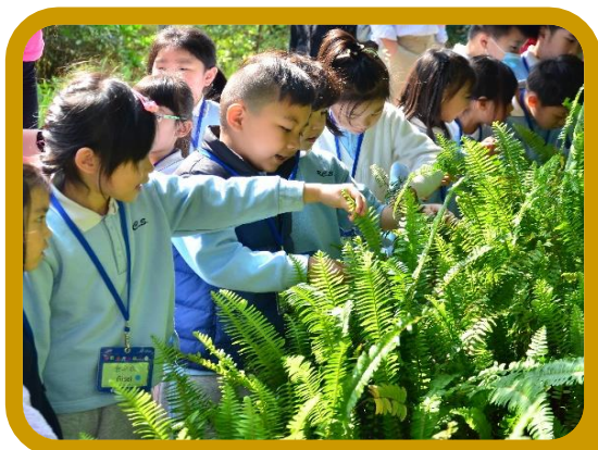
Outdoor Visit Activity