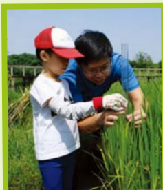
讓我量度稻米的長度吧！ Let me measure the height of rice plant!