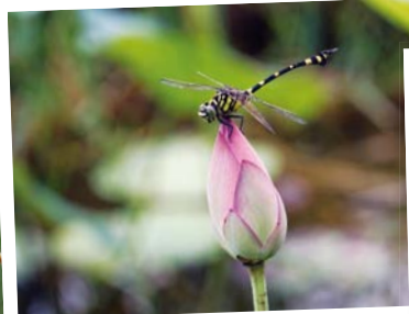
霸王葉春蜓 Common Flangetail