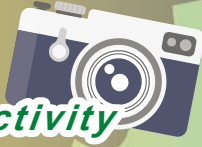
Photo Collection Activity

兩部全新的相片收集機已經正式投入服務！全新介面及操作系統更簡單易用，讓你可以輕鬆上傳相片。訪客只要遞交在濕地公園拍攝的鳥類相片，即可換領紀念品乙份，優秀作品更會於濕地快拍展出！快來跟大家分享你的精彩作品吧！