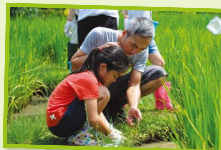
除草工作可不簡單呢！ It was not easy to weed!