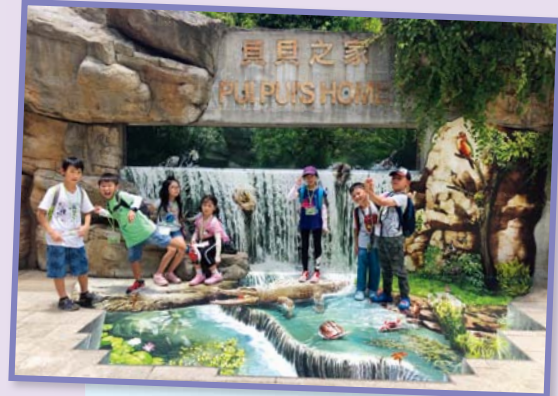
在貝貝之家前拍下的小組合照！ A group photo at Pui Pui's Home!