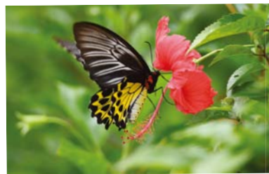
裳鳳蝶 Common Birdwing