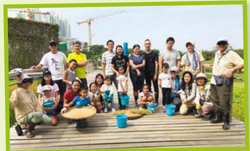
稻米大豐收！ What a bumper harvest!