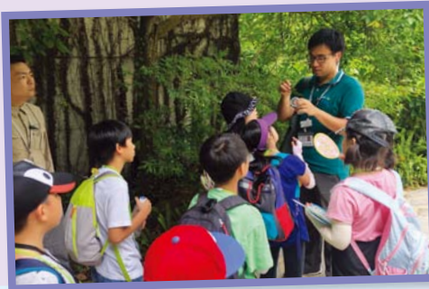
大家非常專心地聆聽濕地導賞員的講解。 Kids were engaged in the tour interpretation.

In this summer, Summer Camp Instructors guided participants to go into the nature and explore the interesting animals and plants in the Wetland Reserve. They also completed a series of challenges!