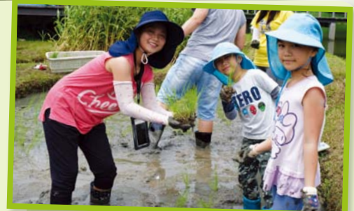
大家合力把小秧苗移植到水田中！ Worked together to transplant the rice seedlings in the paddy field!

Little farmers and their family members experienced rice cultivating processes, including rice transplanting, weeding, threshing as well as conducting ecological survey in paddy field. With their joint efforts, the seedlings finally grew into golden yellow grains! "No Pain, No Gain", farming is interesting!