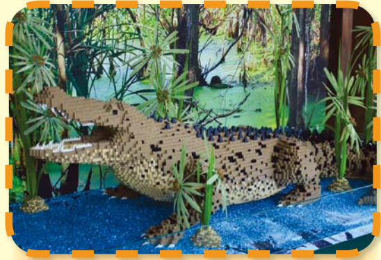
深受大眾歡迎的明星小灣鱷「貝貝」 Our celebrity Saltwater Crocodile "Pui Pui"

People living in the city are busy, venturing into the nature can help soothing one's mind. Kids should also enhance their exposure to and understanding of the nature to nurture their love of it. It is really important for them to learn how to protect the natural environment!