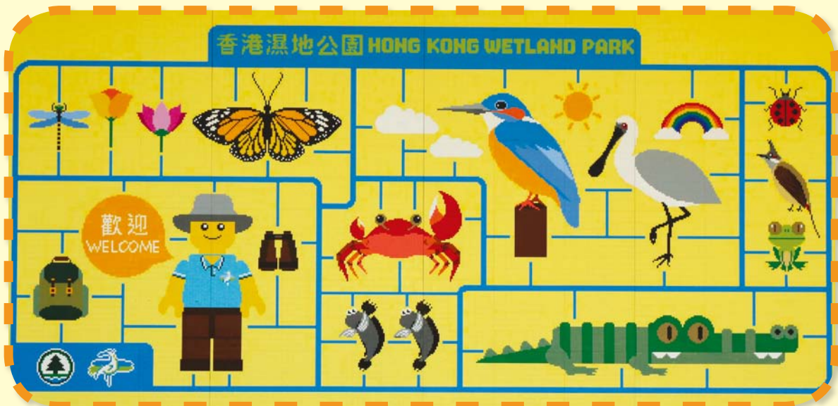
粉絲們千萬不要錯過在入口廣場以樂高®積木拼砌成的牆身藝術啊！ Fans should never miss the art wall created by LEGO® bricks at the Entry Plaza!