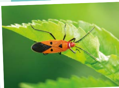
離斑棉紅蝽 Cotton Red Bug

In the past spring and summer, we collected many great photos of animals and plants from our visitors. Let's take a look of the outstanding entries!