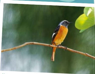
北紅尾鶇 Daurian Redstart