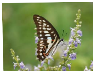
木蘭青鳳蝶 Common Jay