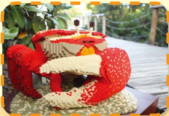
充滿活力的招潮蟹在紅樹木浮橋入口迎接大家！ Energetic Fiddler Crab welcomes you at the entrance of Mangrove Boardwalk