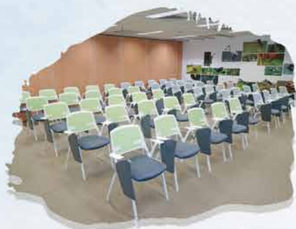
多用途室 1 Multi-function room 1 座位 Seating capacity: 50

Hong Kong Wetland Park provides theatre and multi-function rooms hiring services. Schools are welcome to rent the venues for meetings, workshops or education activities that are related to nature conservation and education.