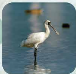
黑臉琵鷺 Black-faced Spoonbill