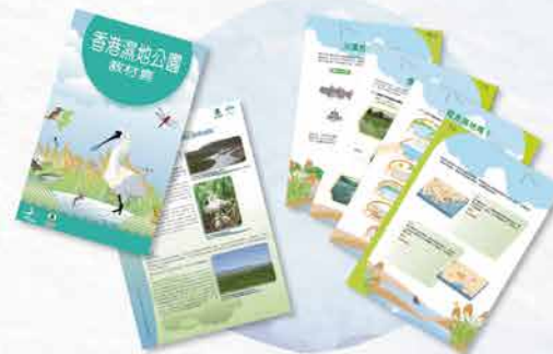
教材套及工作紙 Teaching Kits and Worksheets

Hong Kong Wetland Park has produced numerous teaching resources, including fact sheets, wildlife identification cards, pamphlets, education kits and worksheets, and self-paced visit plans for helping teachers to prepare educational activities related to wetland ecology and conservation. All teaching resources are available for download on HKWP's website.