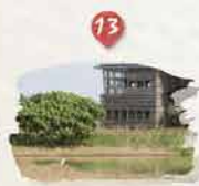
魚塘觀鳥屋 Fishpond Hide