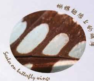
Scales on butterfly wings