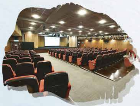
放映室 Theatre 座位 Seating capacity: 207