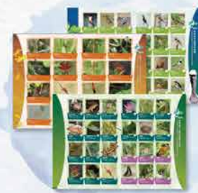
生物圖鑑 Wildlife Identification Cards