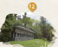
泥灘觀鳥屋 Mudflat Hide