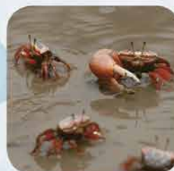
弧邊招潮蟹 Fiddler Crab