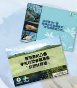
學校自助參觀專案 Self-paced Visit Plans for Schools