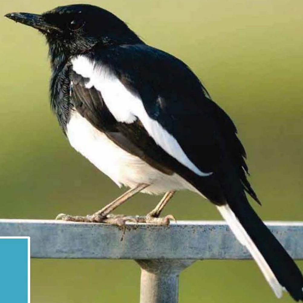
Oriental Magpie Robin Copsychus saularis