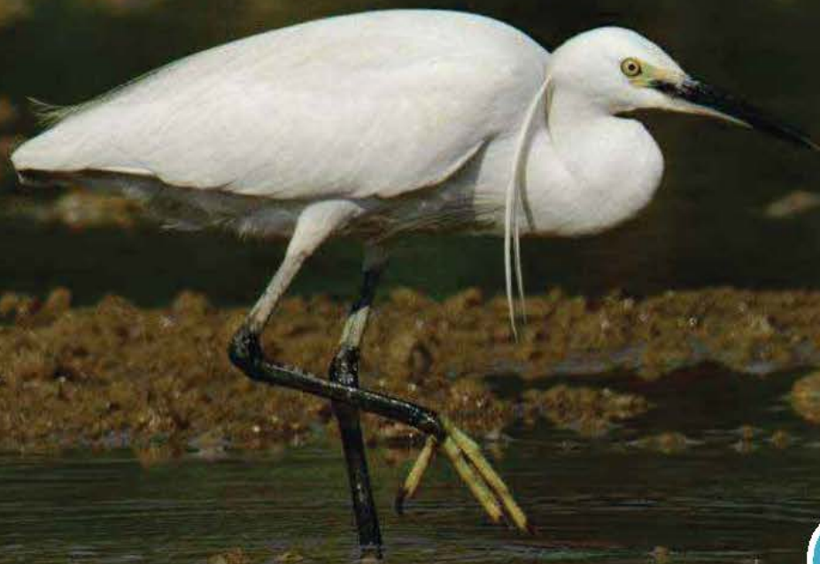
Little Egret Egretta garzetta