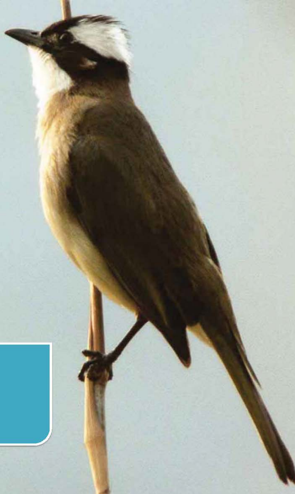
Chinese Bulbul Pycnonotus sinensis