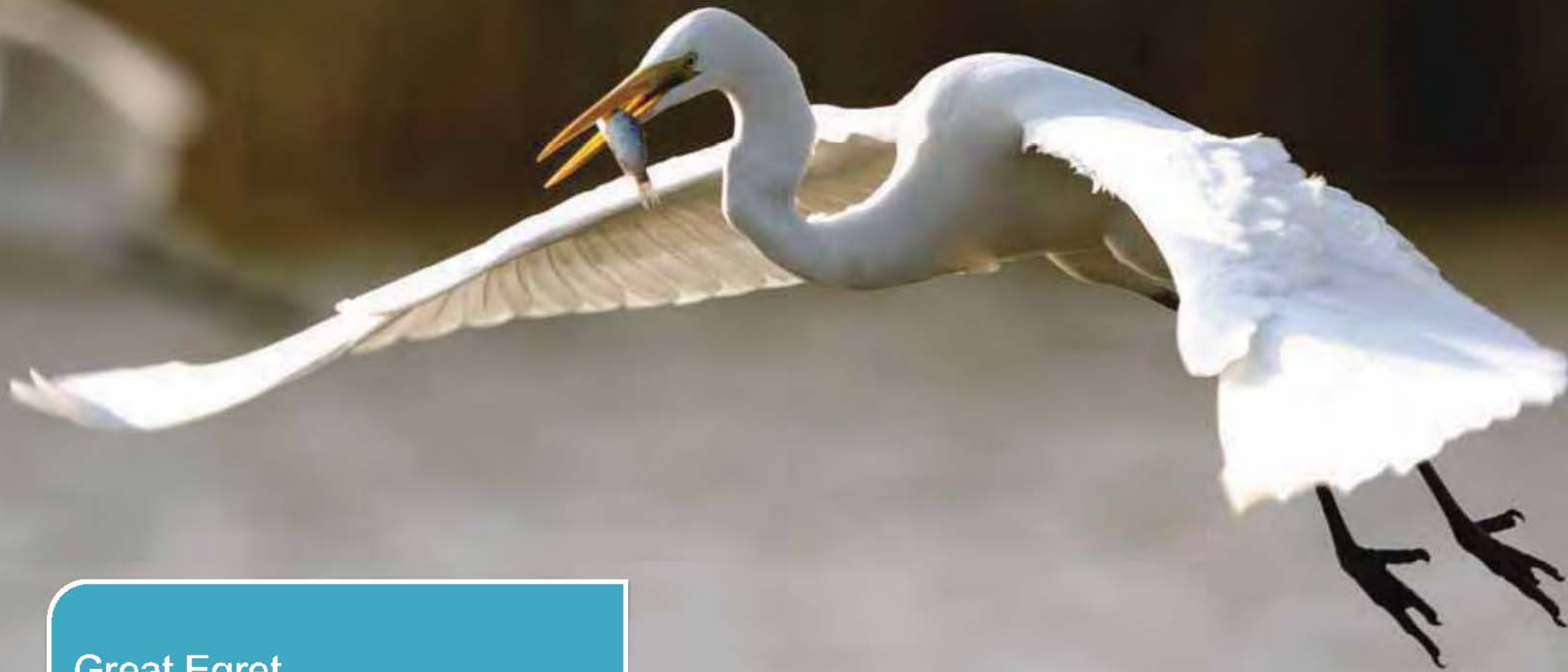
Great Egret Ardea alba