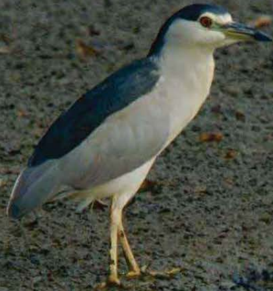
Black-crowned Night Heron Nycticorax nycticorax