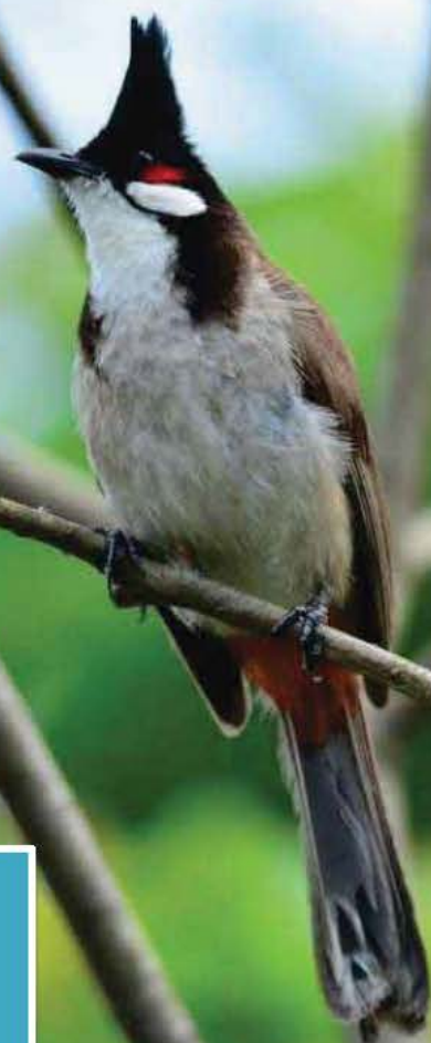
Red-whiskered Bulbul Pycnonotus jocosus