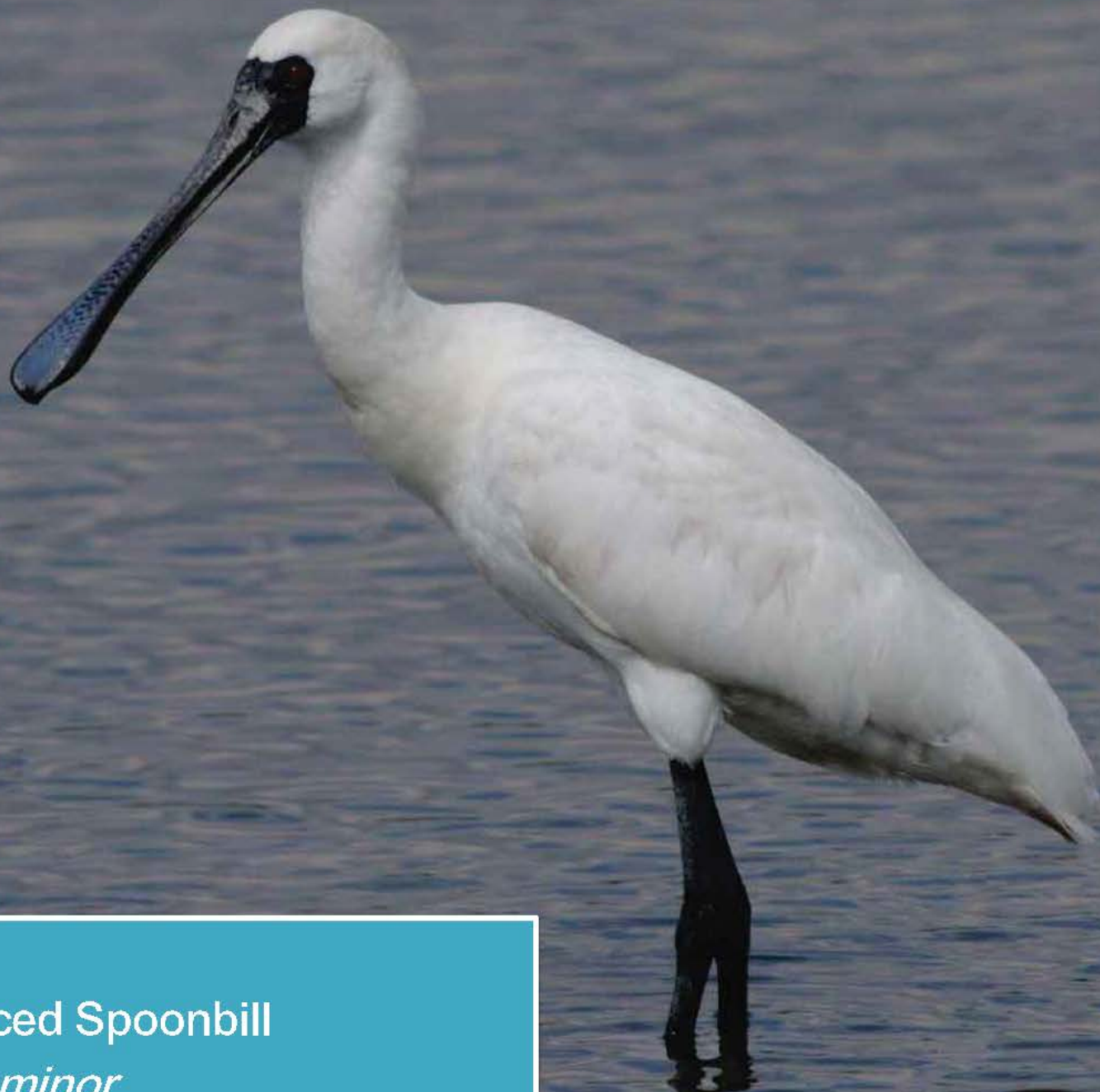
Black-faced Spoonbill Platalea minor