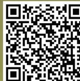
Sound of Common Kingfisher