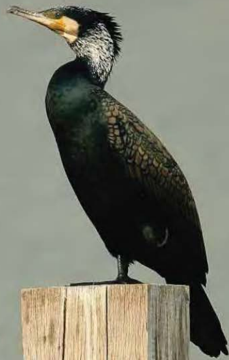
Great Cormorant Phalacrocorax carbo