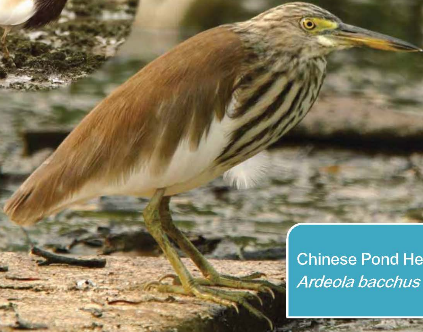
Chinese Pond Heron Ardeola bacchus