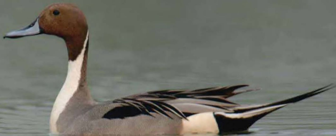
Northern Pintail Anas acuta