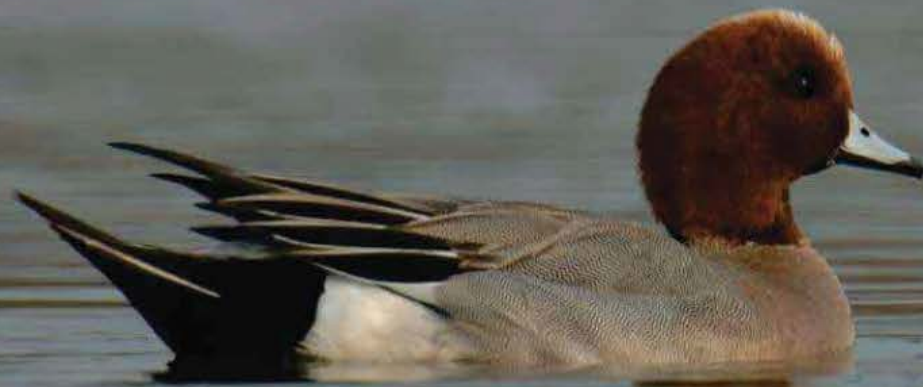
Eurasian Wigeon Anas penelope