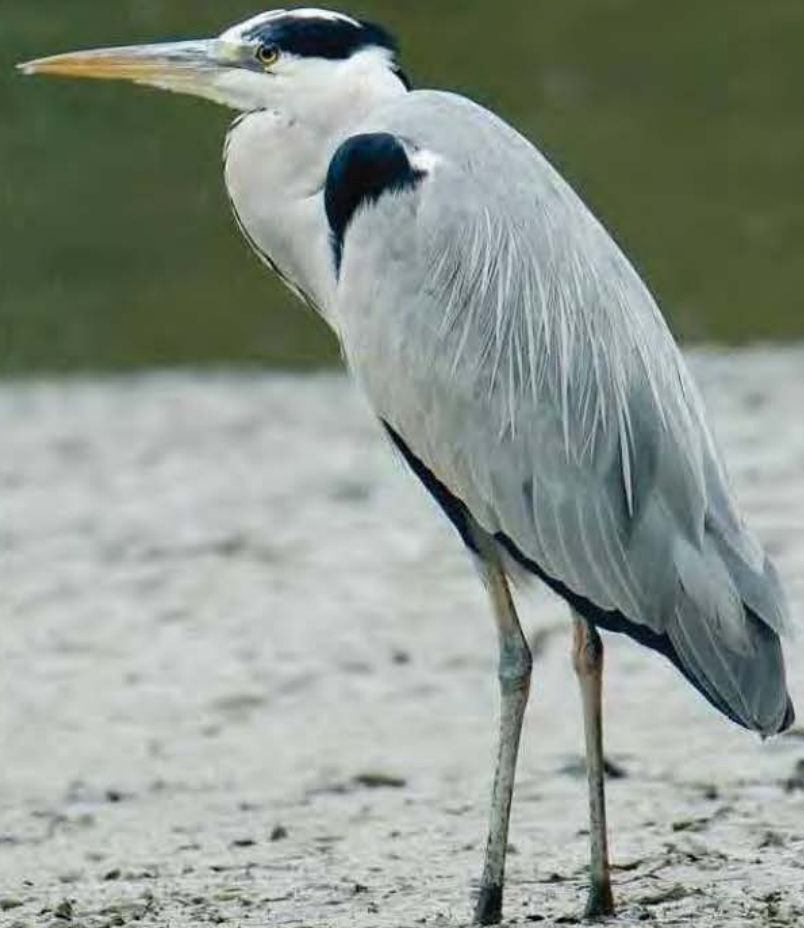
Grey Heron Ardea cinerea